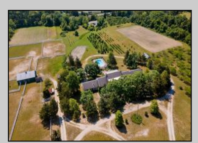
3065 Route 9 So. Seaville, NJ 08230