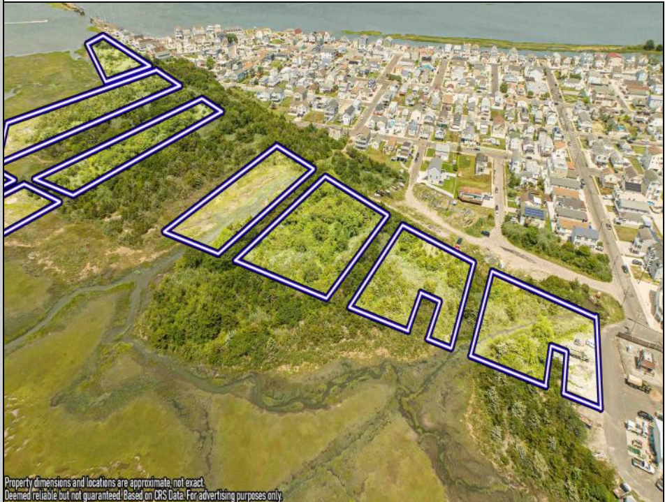
Property dimensions and locations are approximate, not exact. Deemed reliable but not guaranteed. Based on CRIS Data. For advertising purposes only.