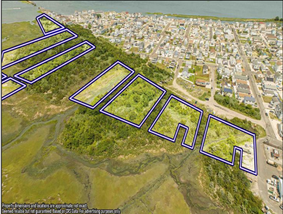
Property dimensions and locations are approximate, not exact. Deemed reliable but not guaranteed. Based on CRIS Data. For advertising purposes only.