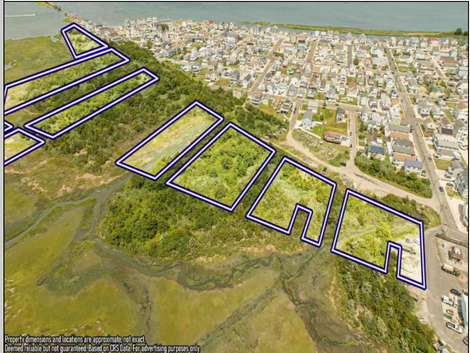
Property dimensions and locations are approximate, not exact. Deemed reliable but not guaranteed. Based on CRIS Data. For advertising purposes only.