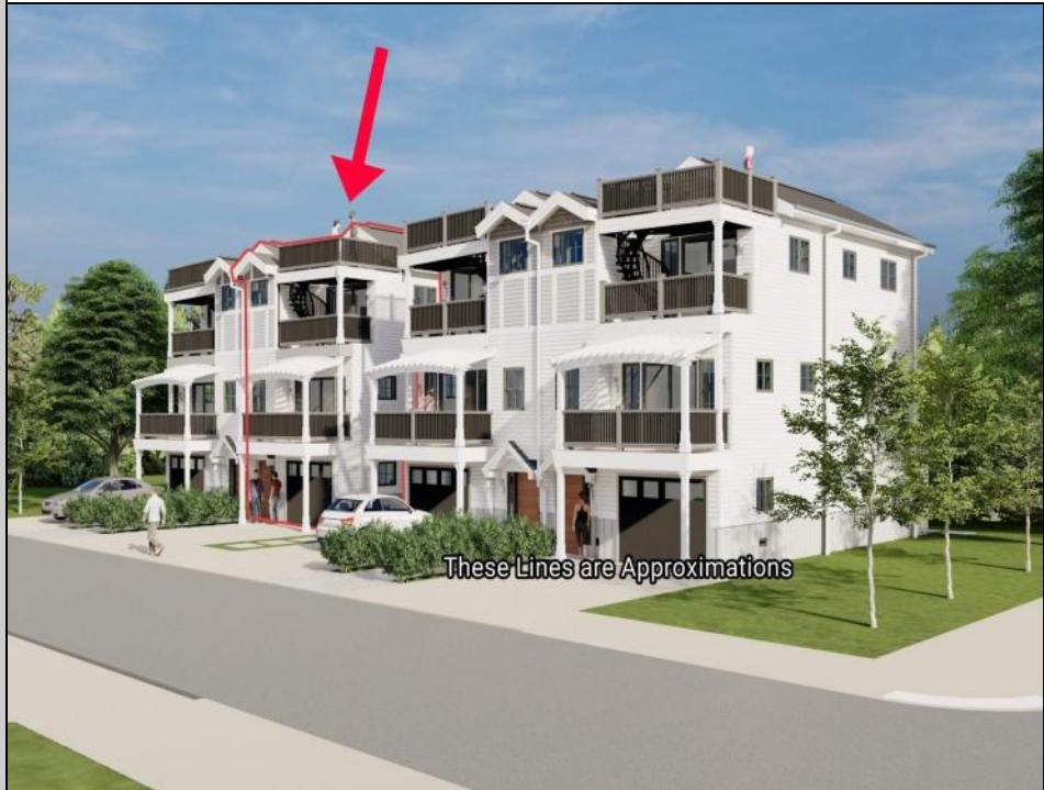
These Lines are Approximations