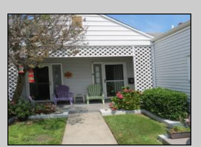
213 25th North Wildwood, NJ 08260