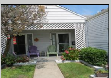
213 25th North Wildwood, NJ 08260