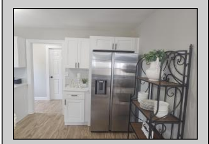
417 St. Johns Villas, NJ 08251