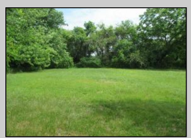
693 Townbank Lower Township, NJ 08204