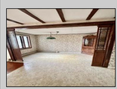
602 Wilson North Cape May, NJ 08204