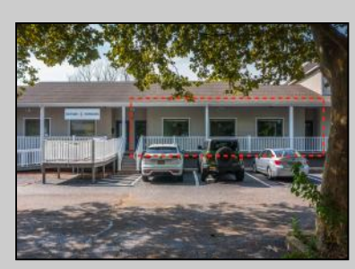
937 Columbia Cape May, NJ 08204