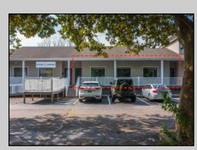
937 Columbia Cape May, NJ 08204