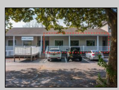
937 Columbia Cape May, NJ 08204