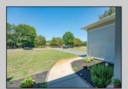
70 Cedar Meadow Cape May Court House, NJ 08210