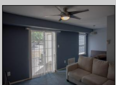
105 Edgewater Galloway Township, NJ 08205