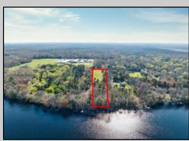
163 Fidler Dennisville, NJ 08270