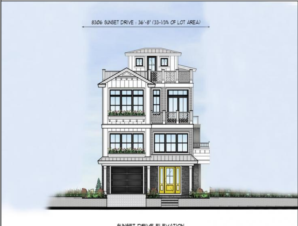
SUNSET DRIVE ELEVATION