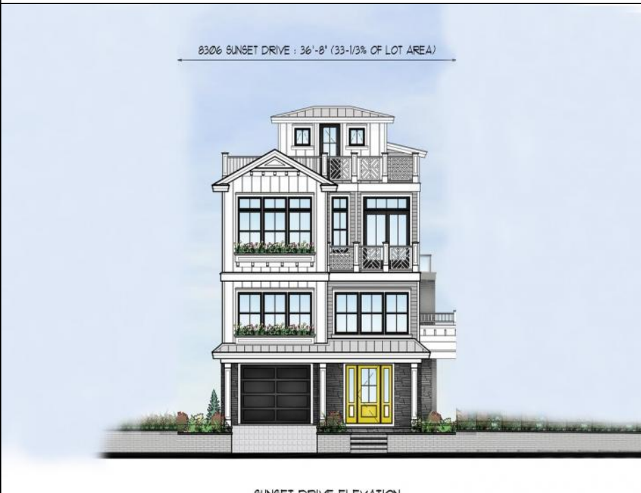
SUNSET DRIVE ELEVATION