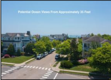
Potential Ocean Views From Approximately 35 Feet