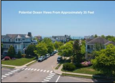
Potential Ocean Views From Approximately 35 Feet