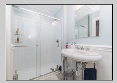
1320 Cape May Cape May, NJ 08204