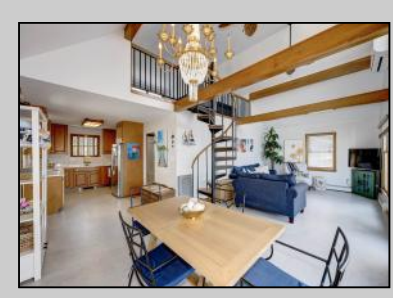
749 Stone Harbor Cape May Court House, NJ 08210