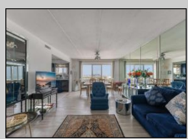
1900 Boardwalk North Wildwood, NJ 08260