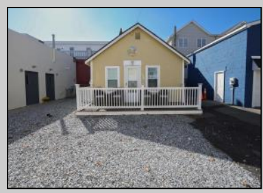
3000 Pacific Wildwood, NJ 08260