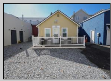
3000 Pacific Wildwood, NJ 08260