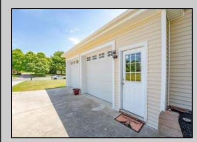
5 Camlough Petersburg, NJ 08270