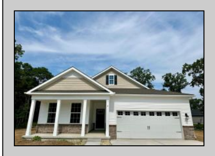
2 Hawks Ridge South Seaville, NJ 08210