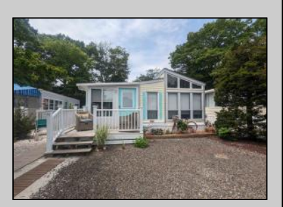
35 Lake Marmora, NJ 08223