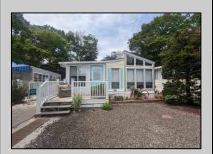
35 Lake Marmora, NJ 08223