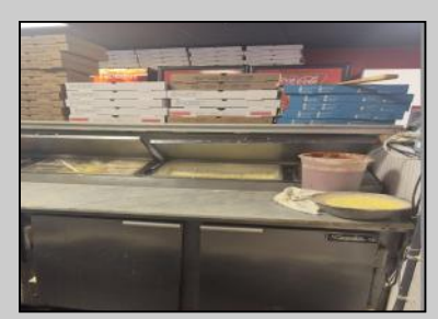
4105 Landis Sea Isle City, NJ 08243