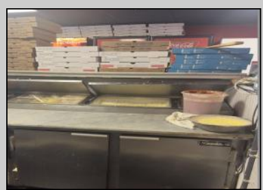
4105 Landis Sea Isle City, NJ 08243