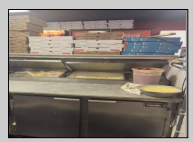
4105 Landis Sea Isle City, NJ 08243