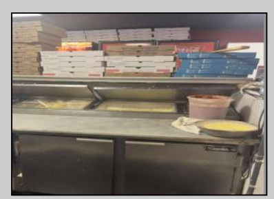
4105 Landis Sea Isle City, NJ 08243