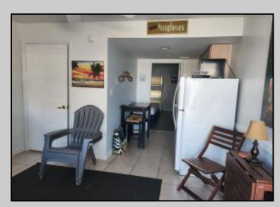
8401 Atlantic Wildwood Crest, NJ 08260