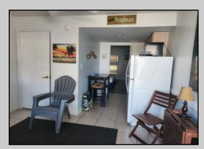
8401 Atlantic Wildwood Crest, NJ 08260