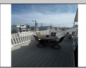
7908 Landis Sea Isle City, NJ 08243