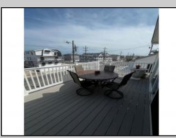
7908 Landis Sea Isle City, NJ 08243