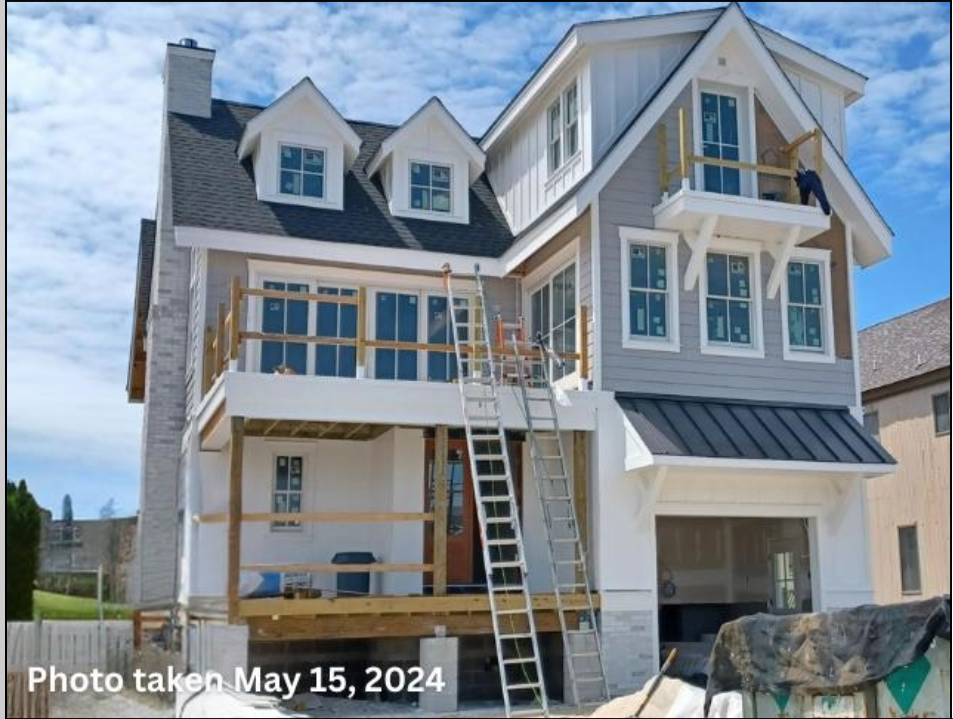
Photo taken May 15, 2024