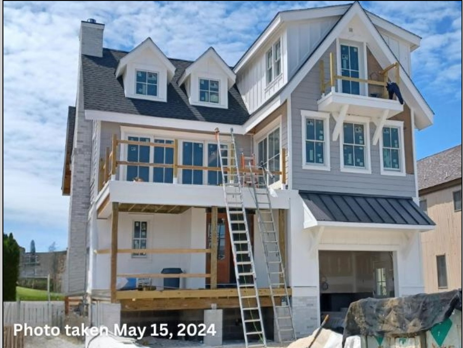
Photo taken May 15, 2024