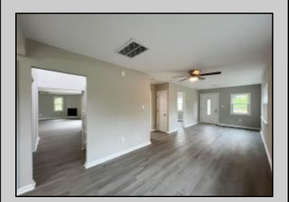
1091 Rt 50 Petersburg, NJ 08270