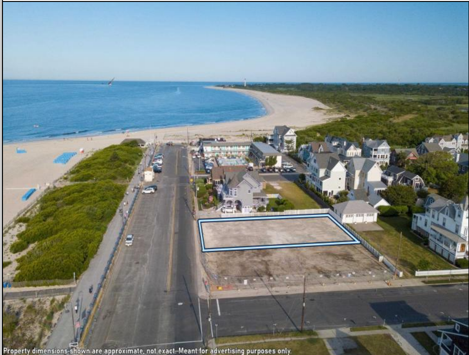
Property dimensions shown are approximate, not exact. Meant for advertising purposes only.