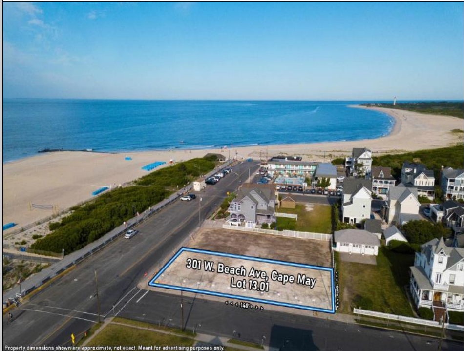
Property dimensions shown are approximate, not exact. Meant for advertising purposes only.