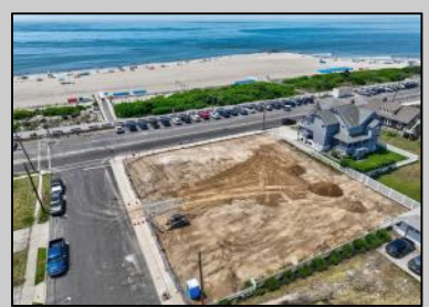
301 Beach Cape May, NJ 08204