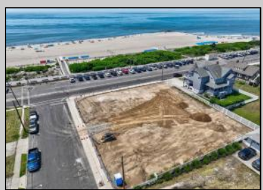
301 Beach Cape May, NJ 08204