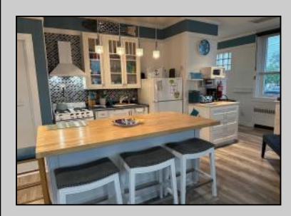
3201 New Jersey Wildwood, NJ 08260