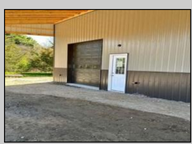
66 Route 47 Cape May Court House, NJ 08210