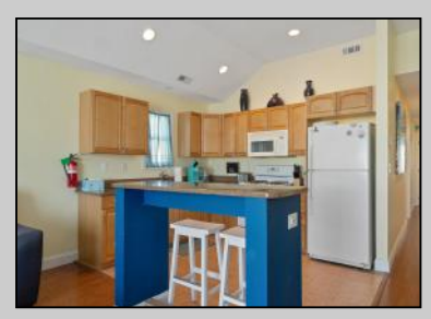
141 Rio Grande Wildwood, NJ 08260