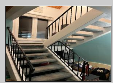
100 Seabreeze North Wildwood, NJ 08260