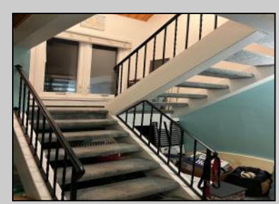
100 Seabreeze North Wildwood, NJ 08260