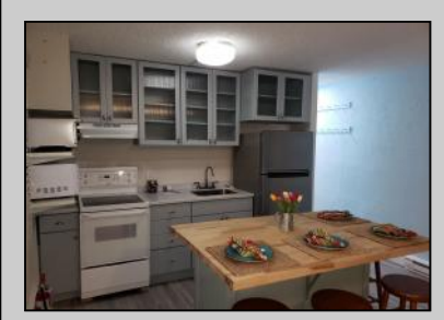
5605 Seaview Wildwood Crest, NJ 08260